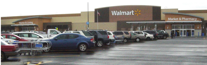
Since its opening in October, the Walmart Supercenter has seen a steady flow of customers.

square-foot store on Bishop Boulevard was issued in December of 2009. Contractors took advantage of last year's mild winter to complete this major project in a timely fashion. The original application materials for this development were submitted to the city in October of 2004. Several appeals and project revisions delayed the construction of the facility.