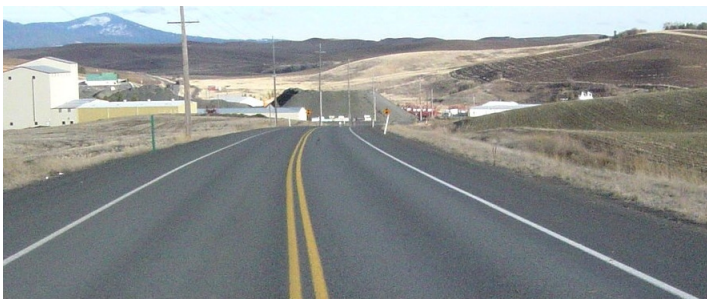
The proposed Mader North Annexation encompasses land on both sides of Albion Road.